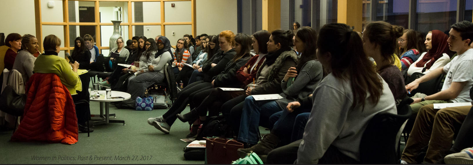
Women in Politics: Past & Present, March 27, 2017